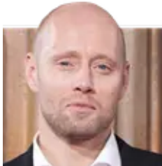
AKSEL HENNIE MAX MANUS