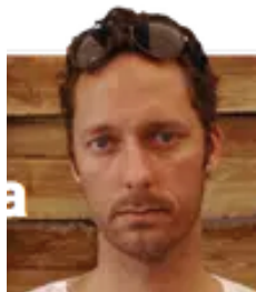
TROND FAUSA LILYHAMMER