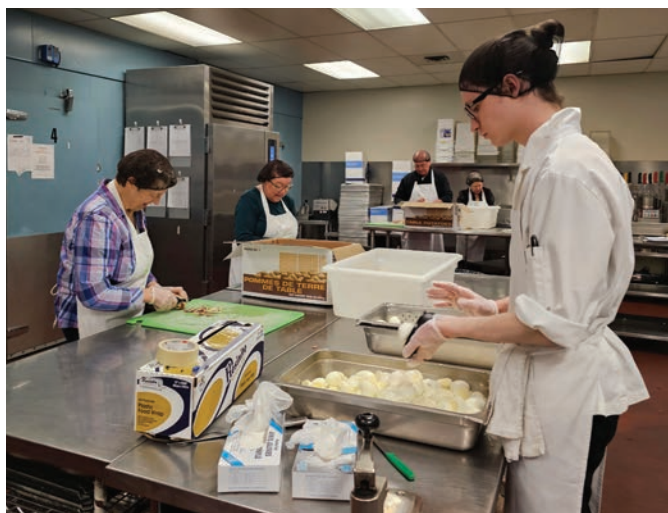
Solglyt Lodge Meals on Wheels volunteers at work.