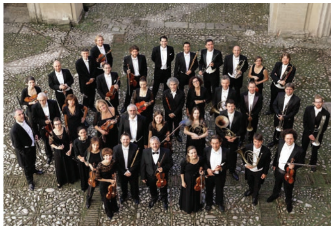
Fabio Biondi & Europa Galante at the Bergen International Festival.