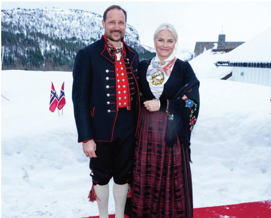
Crown Prince Haakon and Crown Princess Mette-Marit.