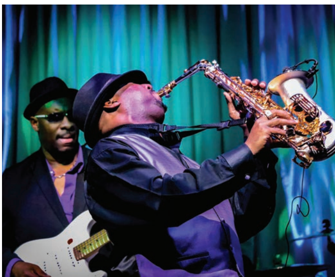
Stavanger MaiJazz festival.

In the first part of May, Stavanger hosts its annual MaiJazz festival. This year, MaiJazz is celebrating for its 35th year. The festival goes from May 9