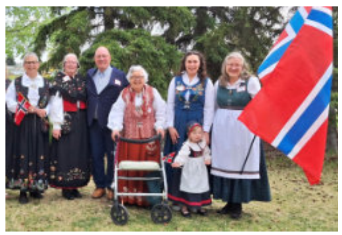
Solglyt members participating in the Syttende Mai Celebration.