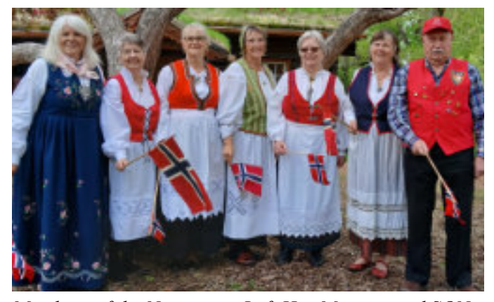
Members of the Norwegian Laft Hus Museum and SON Aspelund Lodge gathered May 17 in front of the Laft Hus after the Bunad Parade.