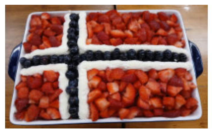
Edie, a member of the Norwegian Laft Hus and accomplished baker, provides a traditional tasty dessert, Strawberry Shortcake, for Red Deer's Syttende Mai Celebration.

For Syttende Mai we joined together with the Norwegian Laft Hus to celebrate Independence Day. A felt & needle craft was offered, delightful lunch including meatball & potatoe soup. Desserts following including the traditional strawberry shortcake. (below top) A Bunad Parade concluded the celebration. (below bottom)