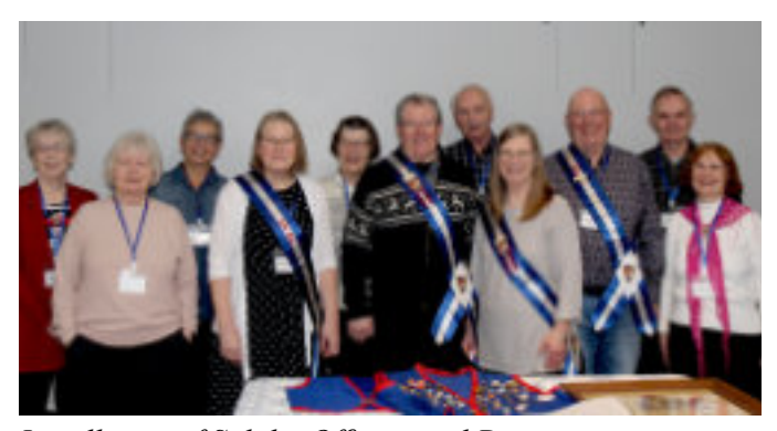
Installation of Solglyt Officers and Directors.

In August, many Solglyt members will be volunteering at the annual Edmonton Heritage Festival in the Scandinavian Pavilion. Norsk Mythology and a Crossings 200 event are in the planning stages for upcoming get togethers, following the summer break. At the monthly Sunday afternoon gatherings, the lodge strives for fellowship and a focus on including Norwegian themes. All members are invited to bring their ideas forward and naturally they like to feature good coffee along with delicious baking donated by members. Solglyt continues to build a network with other Sons of Norway lodges and Nordic societies, in order to foster friendships and create meaningful support for their activities. (below)