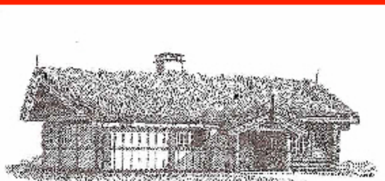
Log house with the sod roof!

We have a barcode scanner now, so faster checkout!